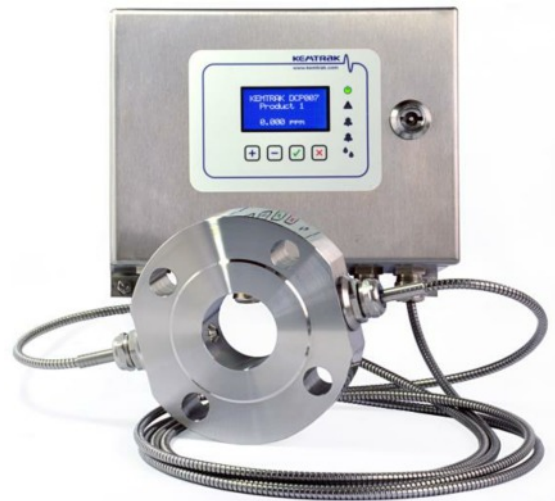
Figure 3: Kemtrak DCP007 NIR photometer with DIN DN50 measurement cell.

Turbid emulsions are accurately measured using the reference wavelength of a Kemtrak DCP007 NIR photometer, allowing both dissolved and suspended water to be monitored. Alternatively, a Kemtrak TC007 turbidimeter is suitable for monitoring water at concentrations above the solubility point. The instruments are calibrated in units of ppm water, providing an accurate measurement of the water content of the sample.