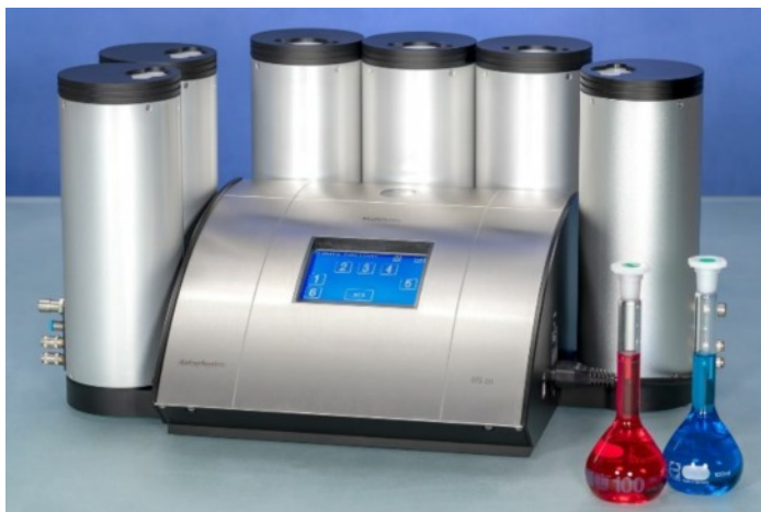
Fig. 2: DataPhysics Instruments stability analysis system MultiScan MS 20 with six independent ScanTower.

With its matching software MSC, the MS 20 is an ideal partner for the stability analysis since even the slightest changes within dispersions can be detected and evaluated. The MS 20 enables a fast and objective analysis of the dispersion stability as well as conclusions on possible destabilisation mechanisms .