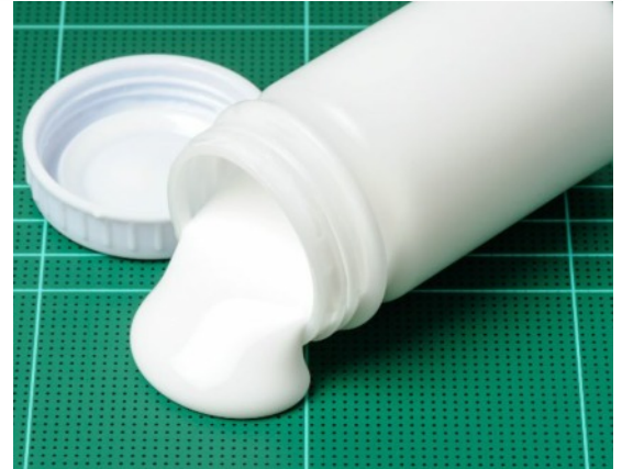
Fig. 1: A polymer emulsion.

Polymer emulsions have been widely applied in different areas as adhesives, binders, coatings, dipped goods, foam products etc, due to their unique properties. A Polymer emulsion is a colloidal dispersion of polymer molecules in an aqueous system. The dispersion stability of a polymer emulsion has a significant impact on its processing, transportation and storage. Among other factors, temperature has a great influence on the dispersion stability. Hence, knowledge of the temperature dependent stability of polymer emulsions is of great interest to modify and improve the formulation for a better processability and performance. As latex is one of the most common and important polymer emulsions, a stability study of two commercially available latex emulsions at different temperatures will be presented throughout this application note.