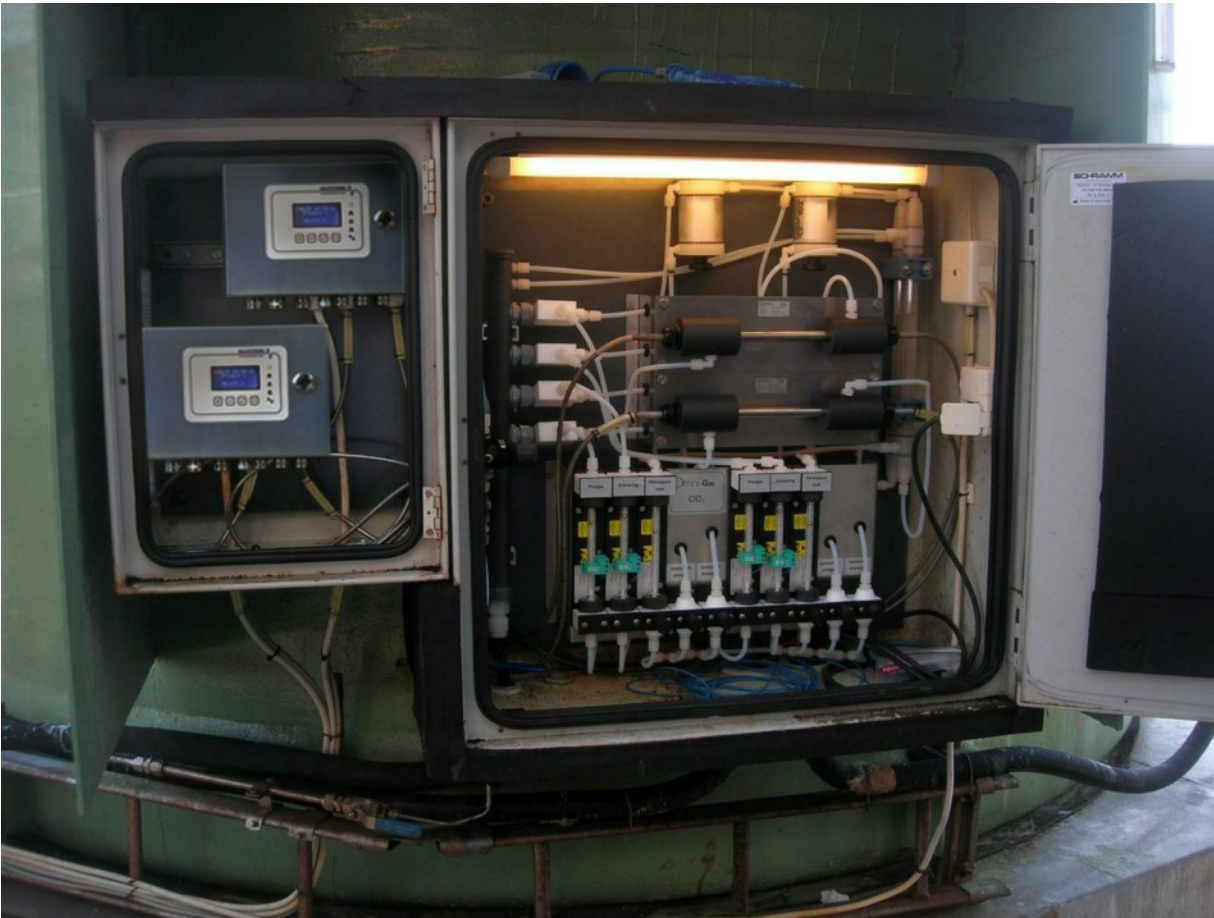
Kemtrak DCP007 process photometer with 200mm optical path length PTFE 25% \text{C} - Titanium measurement cell and extractive gas sampling system